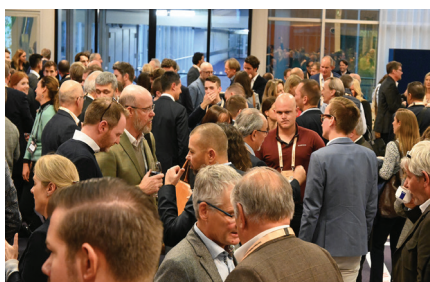
Candid debate is at the heart of the SY Forum experience

Monday's sessions were devoted to the business of superyachts, with discussions around