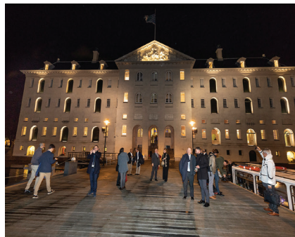
The venue for last night's awards

This year the DAME jury inspected 118 entries from 27 countries, from which it nominated a total of 59 products for consideration in the final judging rounds.