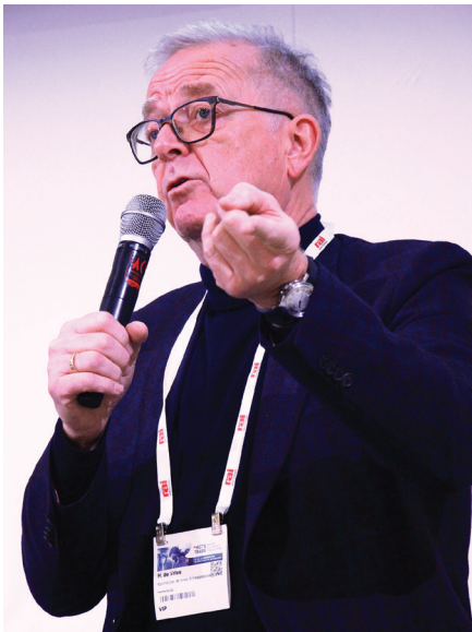
De Vries says industry must embrace sustainability challenge

SYP SUPER YACHT PAVILION MYP MARINA & YARD PAVILION CMP CONSTRUCTION MATERIAL PAVILION