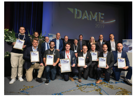
DAME 2019 winners take centre stage

The other category winners were Garmin GPSMAP 86i stand 01.101, 01.103, 01.200 (Marine Electronics and Marine Related Software), Lumitec Moray Flex Light stand 12.505 (Interior Equipment, Furnishing, Materials and Electrical Fittings used in Cabins), Lignia Yacht stand CMP 15 (Marina Equipment, Boatyard Equipment and Boat Construction