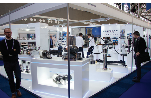
Plenty to see at the Lewmar stand in hall 12 (003, 103)

Following its recent acquisition by Lippert Components Inc (LPI), Lewmar is now firmly at the centre of the group's leisure marine expansion in Europe. The Trend Marine